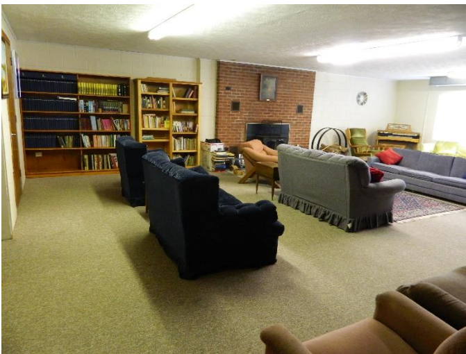
New(er) carpet, furniture and look for fireplace room!