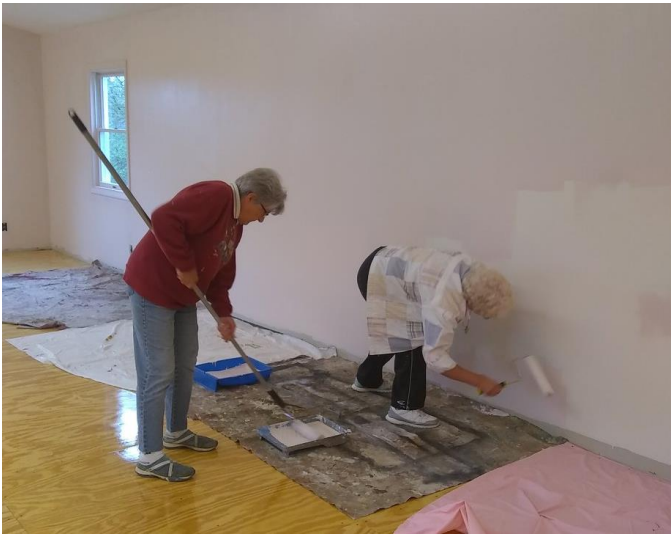
Giving the walls a new look, malted that is...