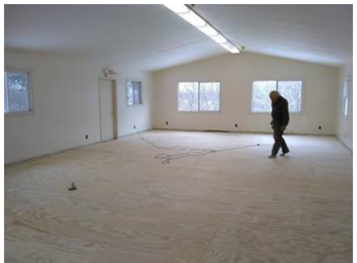
Finished sanding and ready for varnish