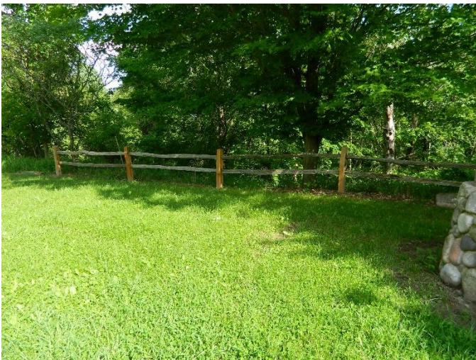
New cedar posts behind the bell