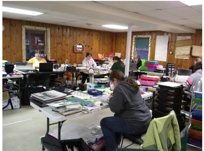
"Scrappers" take over the Dining hall for their Semi-Annual Scrapbooking Retreat