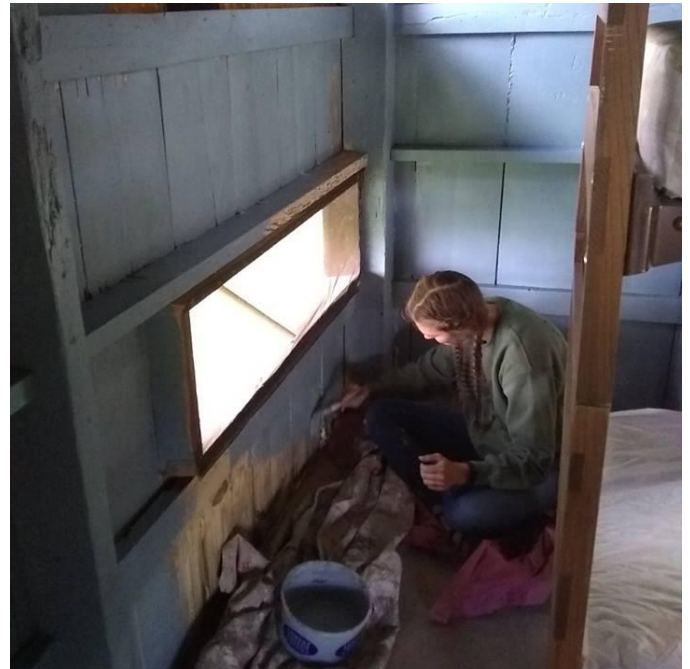
Painting Boy's Cabin 1 interior Sky blue