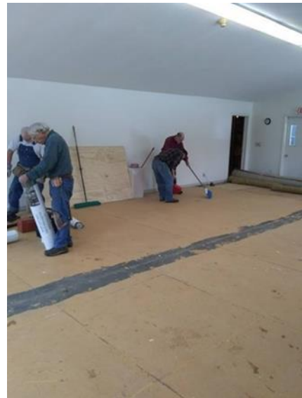
Tearing up the carpet in the rec room