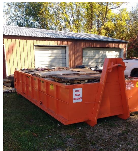
(We had a 10-yard dumpster filled with all the junk wood and materials that were just piled up in the north bay of the camp shop. Our plans are for the shop to be totally organized by winter time.)