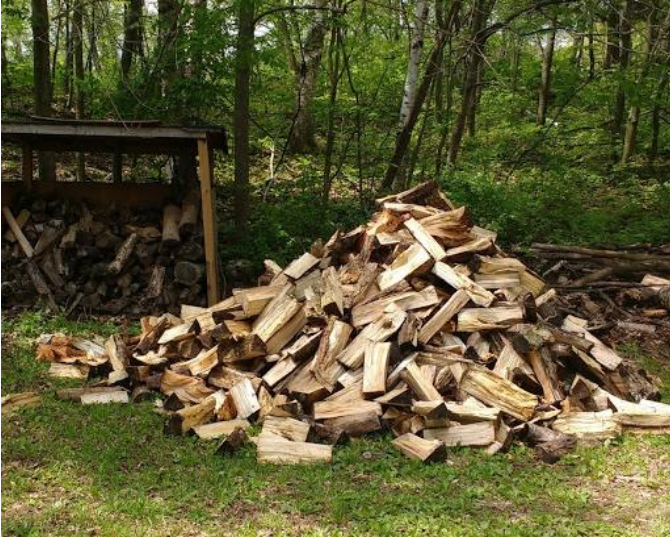
New Log Splitter being put to work