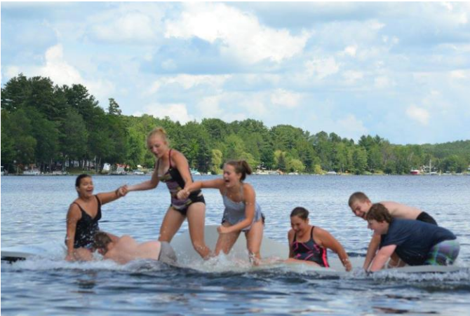
Campers enjoying the new splashpad!