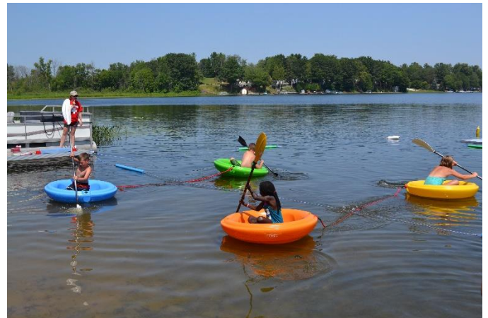
Campers trying out the new Corcls at the waterfront