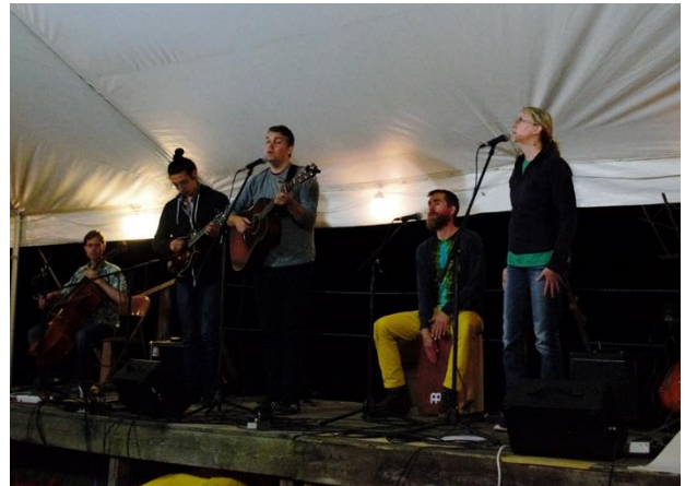
(Photo of musical group Friends with the Weather performing one of the songs off their new album under the big tent at CBH.)

The Annual Song & Story Fest returned to CBH for its second time this summer. They had approximately 125 people for the week (8 of them from Nigeria) as it was another great week of songs, stories, workshops, jam sessions, and concerts focusing on reconciliation, peace, and justice in the Jesus way.