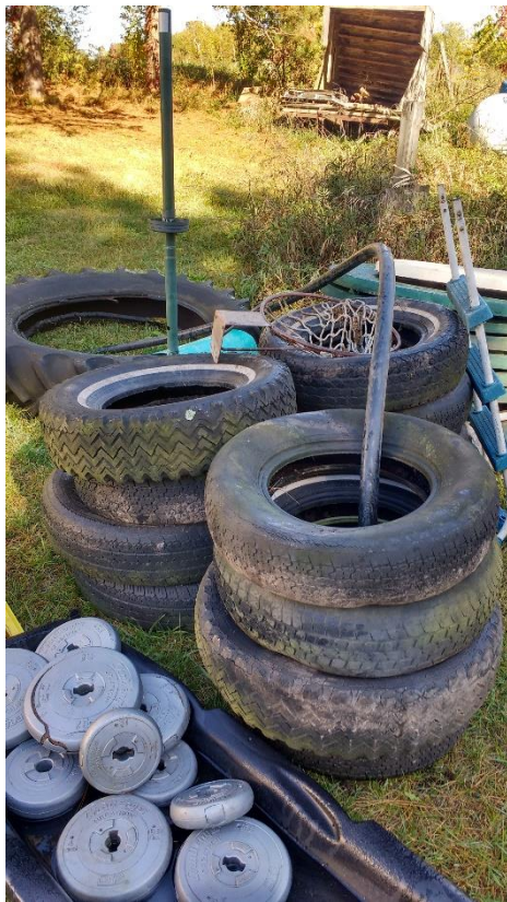
Items from the shop that will be upcycled to nature playscape