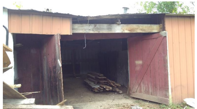
(North bay of the Camp Shop is now cleaned out and ready for a new roof and exterior.)