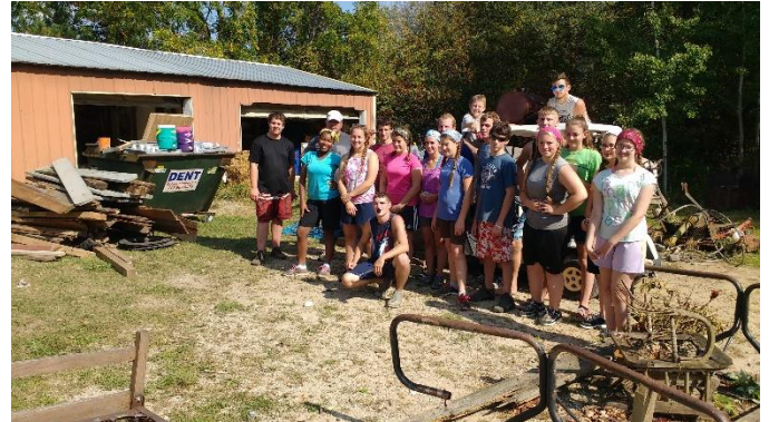
(Bowne Mennonite Youth posing after cleaning out camp's shop area.)

Church youth group (pictured below) for the dirty job of cleaning out and organizing the shop during their youth retreat.