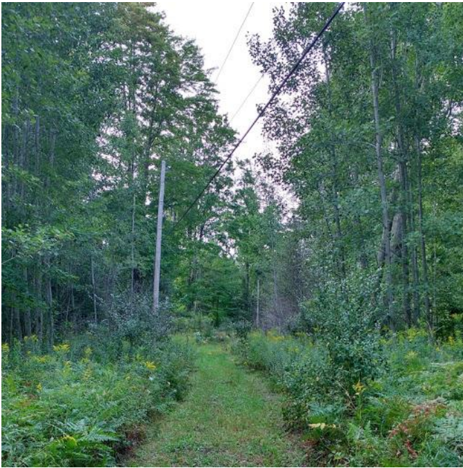
Mowed and opened new trails along the Back 40