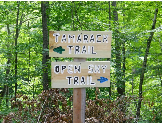
Trails have been named and have new signs