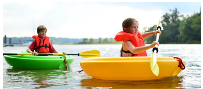
4 Corcls (circular Kayaks)